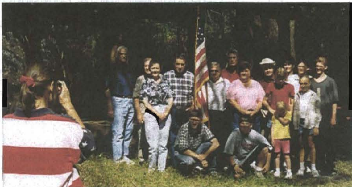
Tampa Chapter SAR & Fort Brooke Chapter CAR Picnic