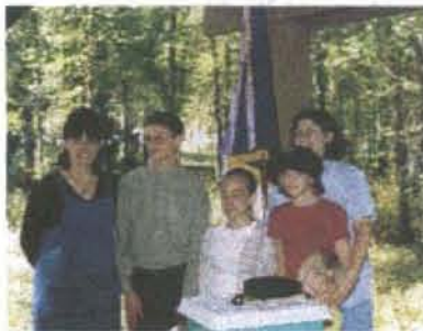
October Picnic Tampa Chapter, SAR & Fort Brooke Chapter CAR At Lettuce Lake Park October 1999

I read in a story in the Brandon Shopper that our President is Chairman of the Historical Resources Review Board and was presenting a plaque for a building in Brandon. Our President is not only a history teacher at Berkeley but very active in a member of a number Historical Societies as well as The Sons of the American Revolution. We are indeed fortunate to have him as a member of our Chapter.