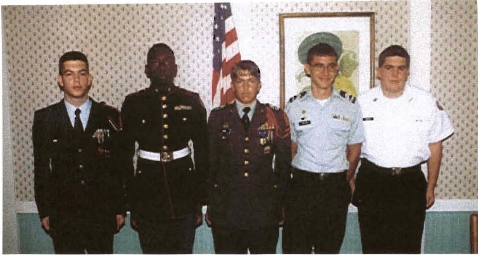
Above Cadets Awarded the ROTC Bronze Medal at our April 19, 2001 Meeting