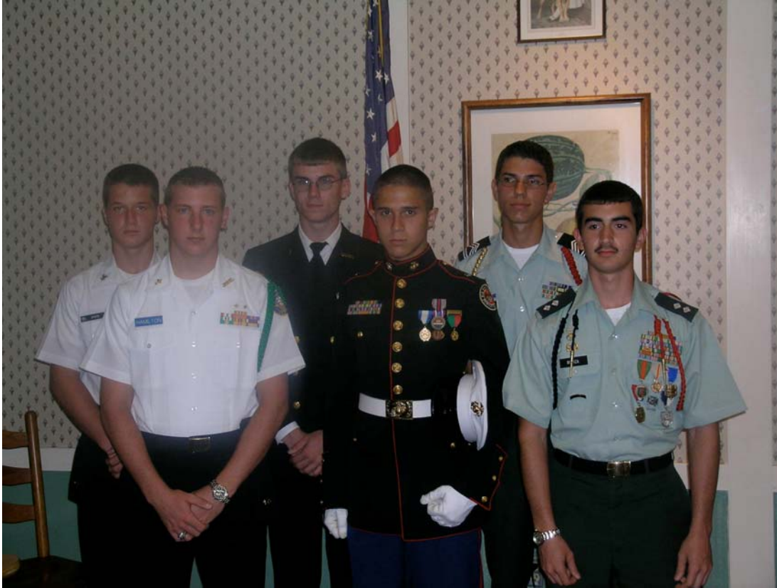
JROTC Members who attended the April meeting and received the SAR Certificates.