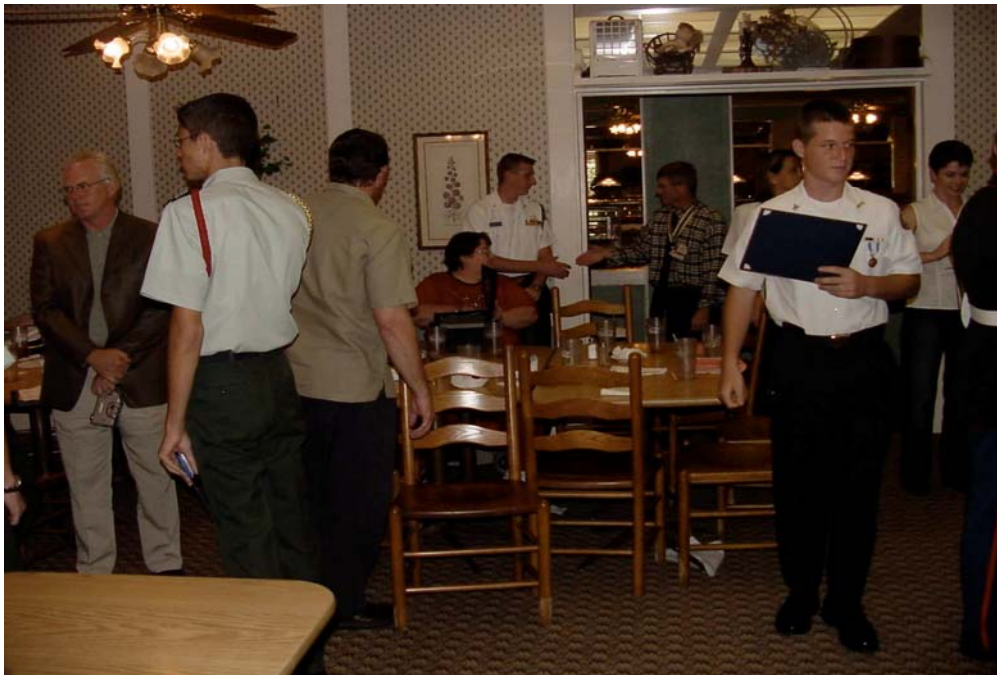
After the meeting, guests and SAR members got to know one another.