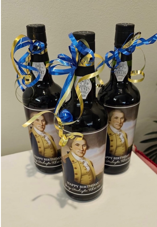
Door prizes were special bottles of Madiera wine with George Washington's portrait