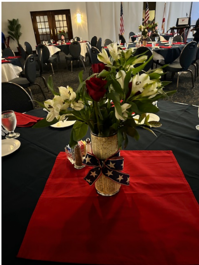
Table decorations for the George Washington Dinner at the St Petersburg Yacht Club

Our February 23, 2024 meeting was held at the St Petersburg Yacht Club as an evening dinner to celebrate George Washington's birthday. This event was open to all compatriots and their family members, as well as members of the DAR chapters.